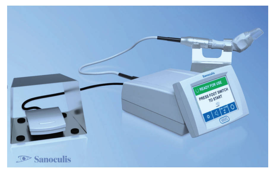
Figure. The MIMS surgical system.

Just before surgery . Approximately 15 to 30 minutes before the start of surgery, one drop of lopidine (apraclonidine 0.1%, Alcon) is instilled to constrict blood vessels and prevent subconjunctival bleeding. Next, some surgeons instill pilocarpine 2% to stretch the iris, make maximum room for the device in the angle, and